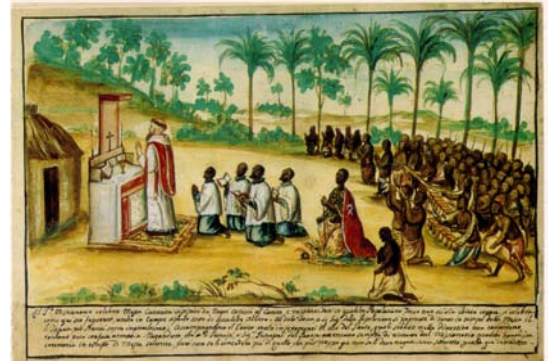
Source 2: Capuchin missionary celebrating Mass, Songo, Kingdom of Kongo, 1740s Collo & Benso 1986: 115