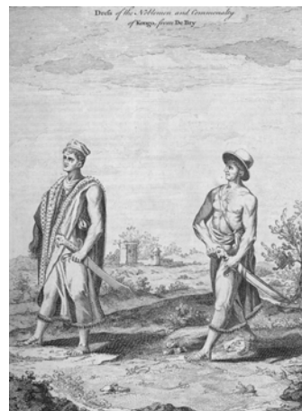
Source 3: Men's clothing styles (noble and commoner), Kongo, late 16th century Astley 1745–7: facing 248